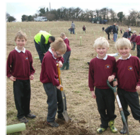
Green-fingered pupils from Crossley Street Primary School enjoying getting involved

One of the latest round of successful applicants was Trees for Cities who were awarded a grant of £5,170 to create a new community woodland at Wetherby Ings. Some 2,500 trees will be planted during the project; many by local volunteers and school children. Work on the project has already begun.