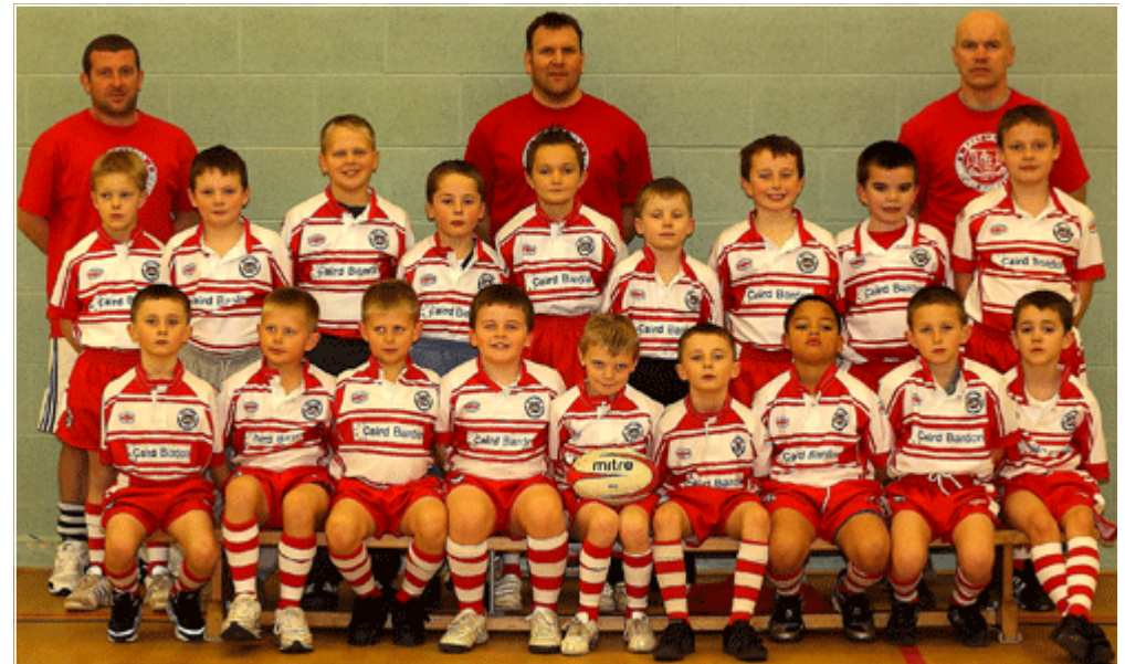
The under 9 team and coaches proudly wearing their new kit

"It is hard not to be excited by the work this amateur rugby club are doing for their local community. Having a facility they can use as a base will allow the Club to grow and forge links with other local sports clubs and community organisations."