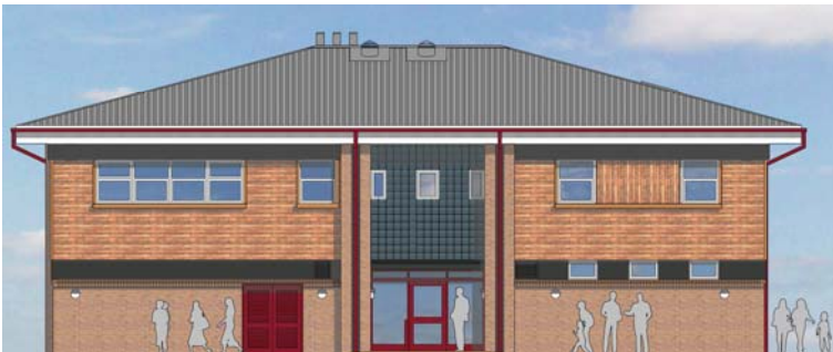
Front Elevation Plan