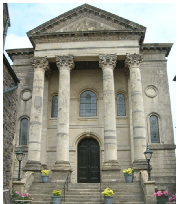
English Baptist Church, Carmarthen