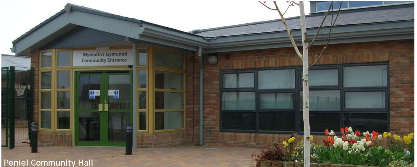
Peniel Community Hall