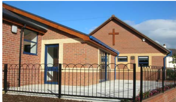
Rothwell Baptist Church

On 18 September 2010, Rothwell Baptist Church was officially re-opened and large numbers of local residents turned out to see the new facilities unveiled. The Church has been transformed into a modern centre with warm, bright spaces for worship and community activities.