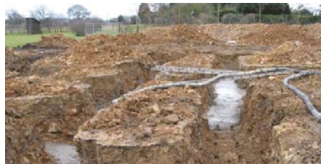
Work Starts at Shadwell Cricket Club

A brand new pavilion is currently being built in Shadwell to replace the existing, temporary portacabins and provide a permanent, modern home for the Club.