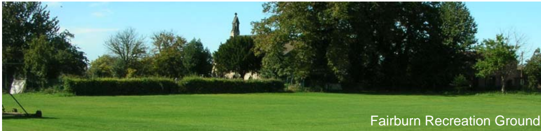
Fairburn Recreation Ground