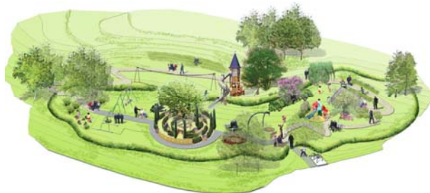
An Artist's Impression of Temple Newsam Phys-Cap Park

The project was awarded a grant of £35,000 from the Caird Bardon Community Programme last year.