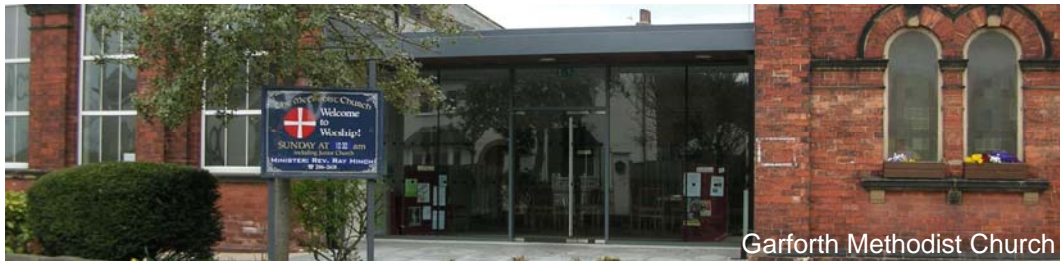
Garforth Methodist Church