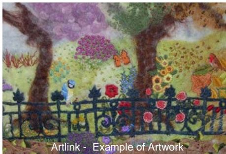
Artlink - Example of Artwork

Provision of additional changing room facilities.