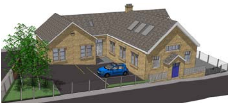
Artist's Impression - Chevin Community Centre

The following projects have all been awarded grants in the last 12 months. They have shared a massive total of £437,593.