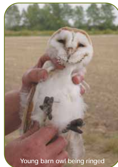
Young barn owl being ringed

For more information, visit www.ottersandrivers.org.uk